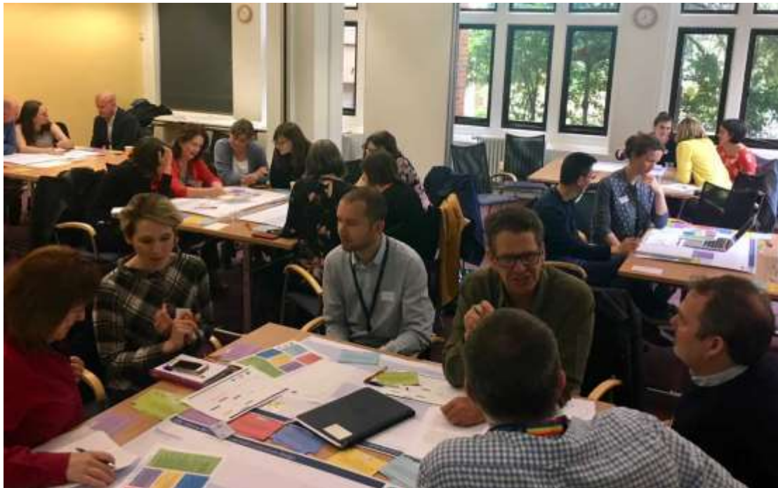
Typical room layout

The workshop is demanding, so tea/coffee and especially water should be provided, if possible. Although there are no breaks in the workshop facilitation plan often can take a break at the storyboard stage.