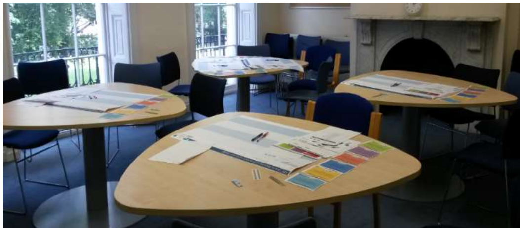
ABC workshop, ready to go

For additional information contact ABC LD team via https://blogs.ucl.ac.uk/abc-ld/ or tweet to @ABC_LD.