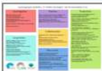
A4 online additional activities – 1 per module