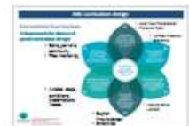
A4 Connected Curriculum 1 per module UCL specific - when localising the ABC method, replace with local strategy

Participants often bring their own laptops to access module outcomes, validation documents and other resources, so it is useful to provide some extra space on the tables.