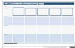
A1 storyboard sheet – 1 per module