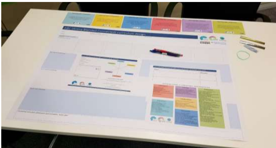
Each module is set up in exactly the same way

It is strongly recommended to keep the resources tidy, and to have the same order of cards and other resources on each of the tables. Each set of resources is arranged around A1 sheet (storyboard sheet). A1 sheet represents a canvas for one module/course. In most cases one sheet is big enough for a design of one course/module.