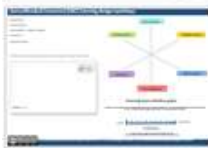
A4 tweet, learning types and blend graph – 1 per module